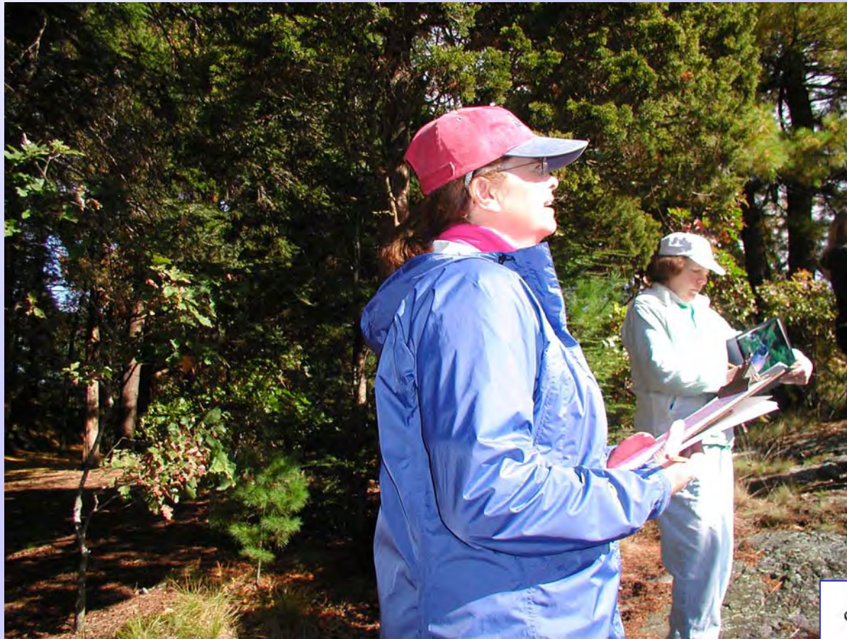
Workshop participants, Natural Resources Trust of Easton