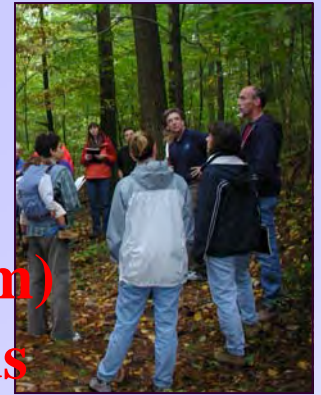
Metacomet Land Trust Sutton, MA

0-25% low bush blueberry, 25-50% wintergreen