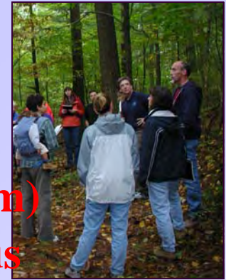
Metacomet Land Trust Sutton, MA