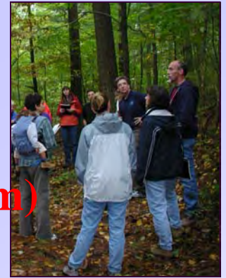
Metacomet Land Trust Sutton, MA

0-25% low bush blueberry, 25-50% wintergreen