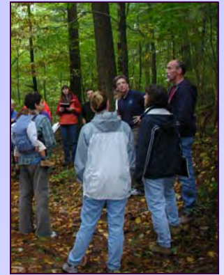
Metacomet Land Trust Sutton, MA

0-25% low bush blueberry, 25-50% wintergreen