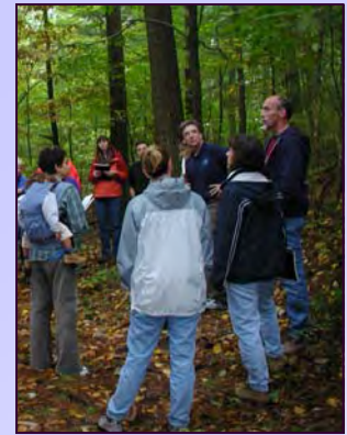
Metacomet Land Trust Sutton, MA

0-25% low bush blueberry, 25-50% wintergreen